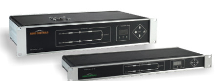
STATIC POWER SWITCHES