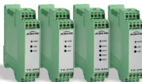
SIGNAL ISOLATORS & TRANSDUCERS