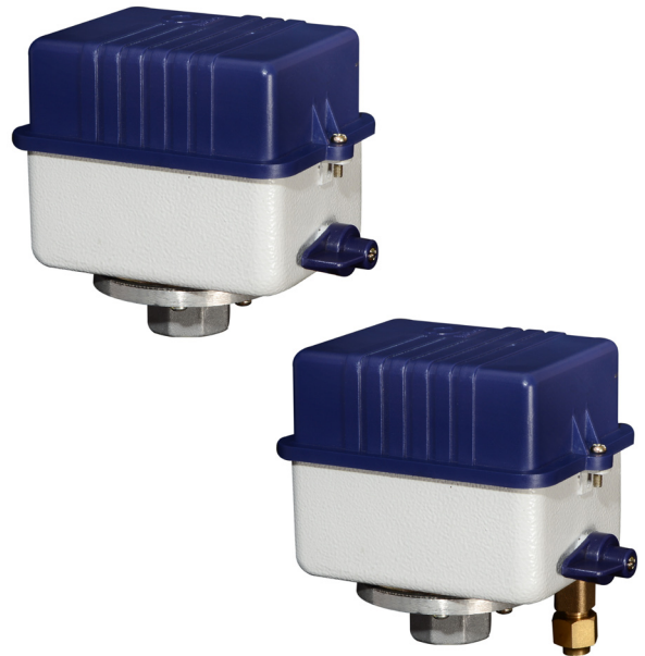
Fig. top: Pressure switch mechanical, model PSM-530 Fig. bottom: Pressure switch mechanical with relief valve, model PSM-530