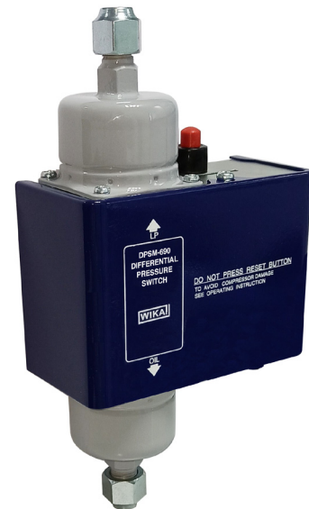
Differential pressure switch, model DPSM-690