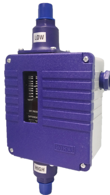
Differential pressure switch mechanical, model DPSM-550